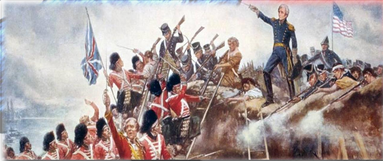
General Andrew Jackson in the Battle of New Orleans