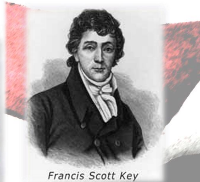
Francis Scott Key