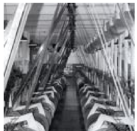
Weave room, Boott Cotton Mills Museum.

In a letter to a friend in 1846, Bagley promoted the labor-reform publication Factory Tracts as representing the interests of those "who are not willing to see our sex made into living machines to do the bidding of the incorporated aristocrats and reduced to a sum for their bodily services hardly sufficient to keep soul and body together." Although the struggles of Bagley and other mill girls to achieve legislation for a 10-hour day failed, Lowell's textile corporations did reduce the workday to 11 hours.