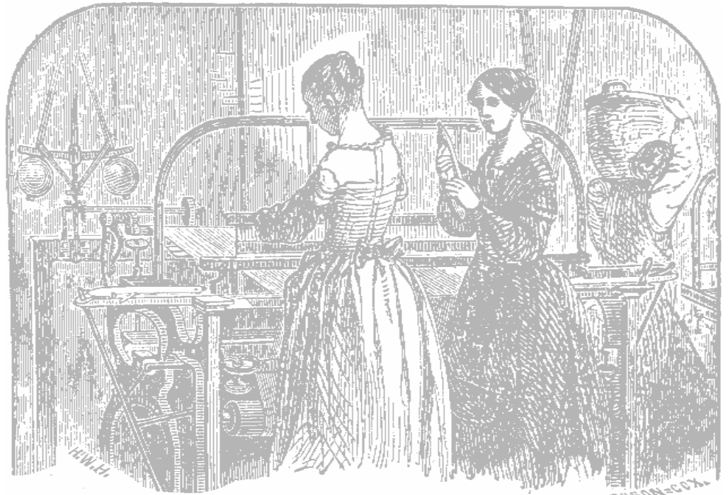
"Power Looms. One Girl Works Four," ca. 1867. Collection of Lowell NHP.

Lowell National Historical Park National Park Service U.S. Department of the Interior