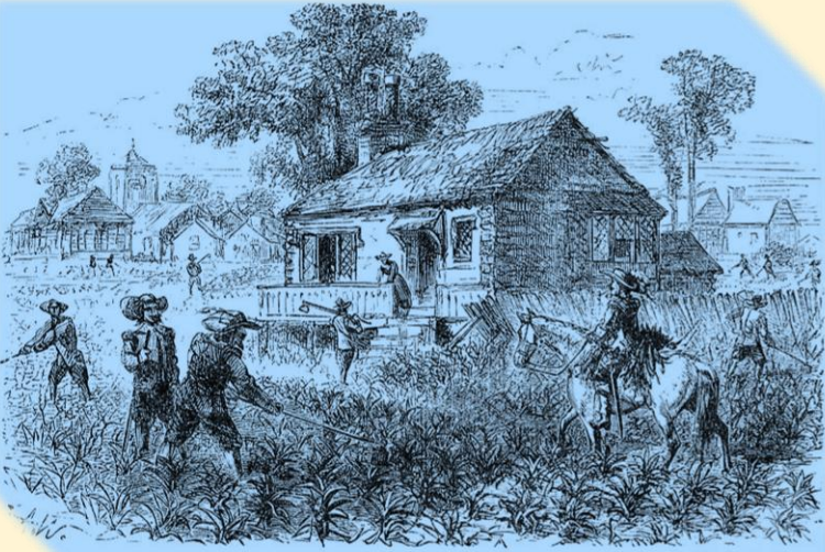
CULTIVATION OF TOBACCO.

COMPREHENSION The use of large-scale agriculture for financial gain